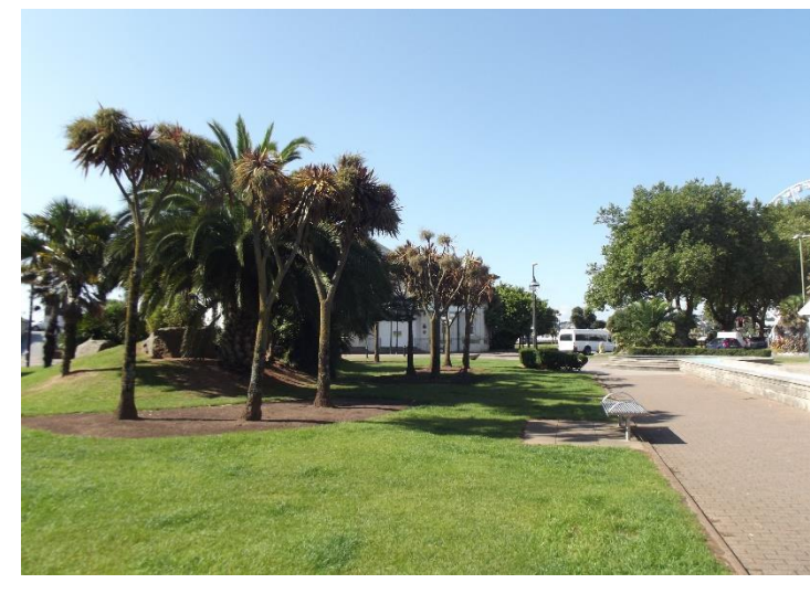
www.bettesworths.co.uk 29/30 Fleet Street Torquay Devon TQ1 1BB