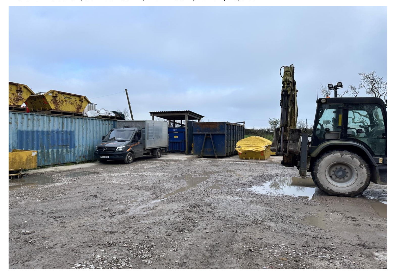
Unique Opportunity to Purchase a Thriving South Hams Business

The Old Abbatoir, Jawbones Hill, Dartmouth, Devon, TQ6 0JZ